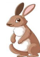
Rosie Rabbit Respect