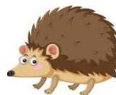
Hugo Hedgehog Honesty