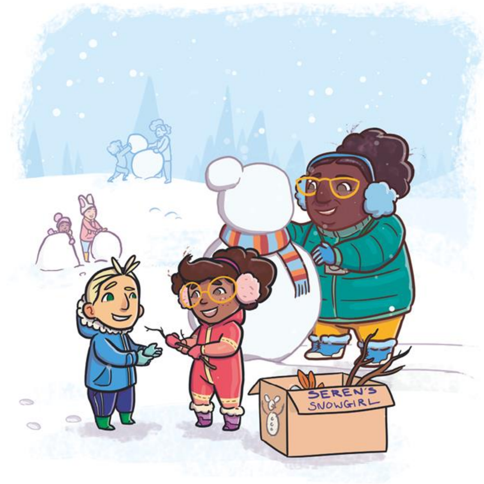
Finally, Seren had everything she needed to build the perfect snowgirl.