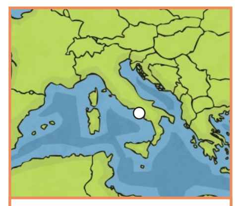
Mount Vesuvius in Italy.

It is thought that Delta belonged to Severinus, and stories say that the dog had already saved his life on previous occasions. The tales of Delta have inspired modern fiction such as 'The Pack of Pompeii'.