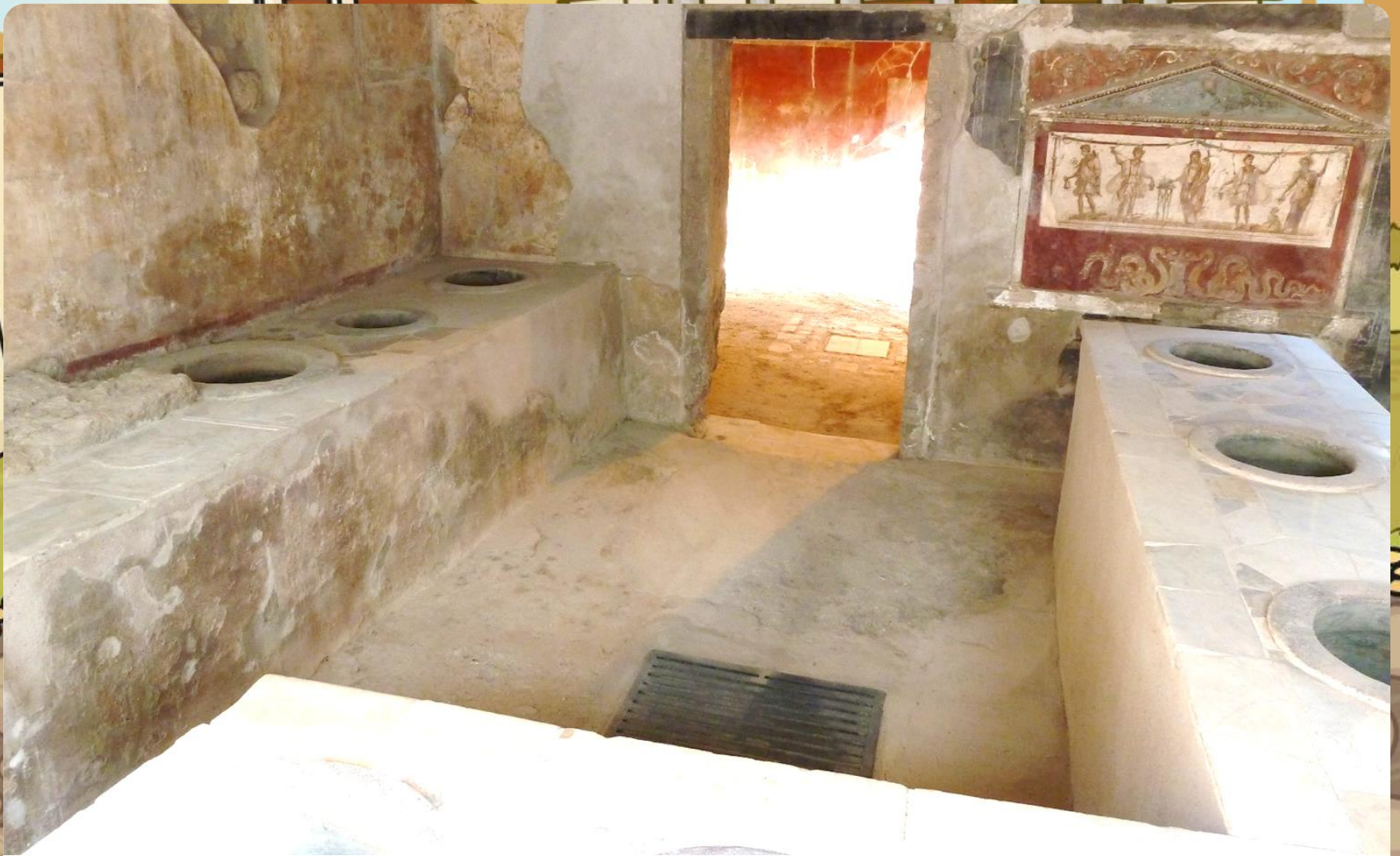
Thermopolium – served hot food