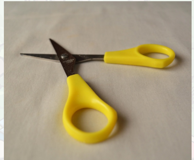
Photo courtesy of (@pixnio.com) - granted under creative commons licence - attribution