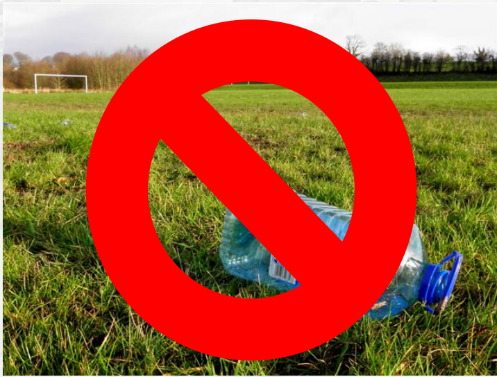
Photo courtesy of (@ geograph.ie ) - granted under creative commons licence – attribution