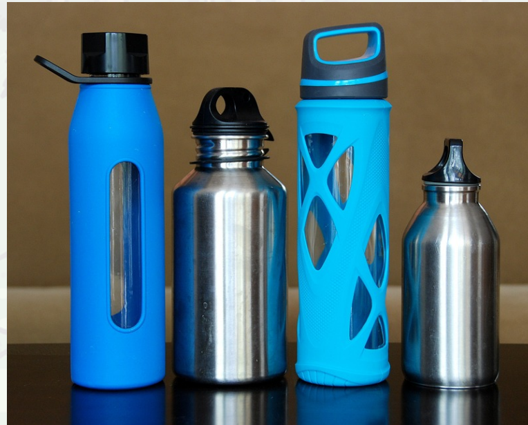
Photo courtesy of (@ pixabay.com ) - granted under creative commons licence - attribution

Photo courtesy of (@ Wikipedia.org ) - granted under creative commons licence - attribution