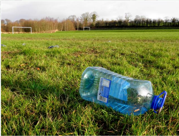
Photo courtesy of (@ geograph.ie ) - granted under creative commons licence – attribution

Look at these two pictures. Which do you think is the right to do, to help the environment?