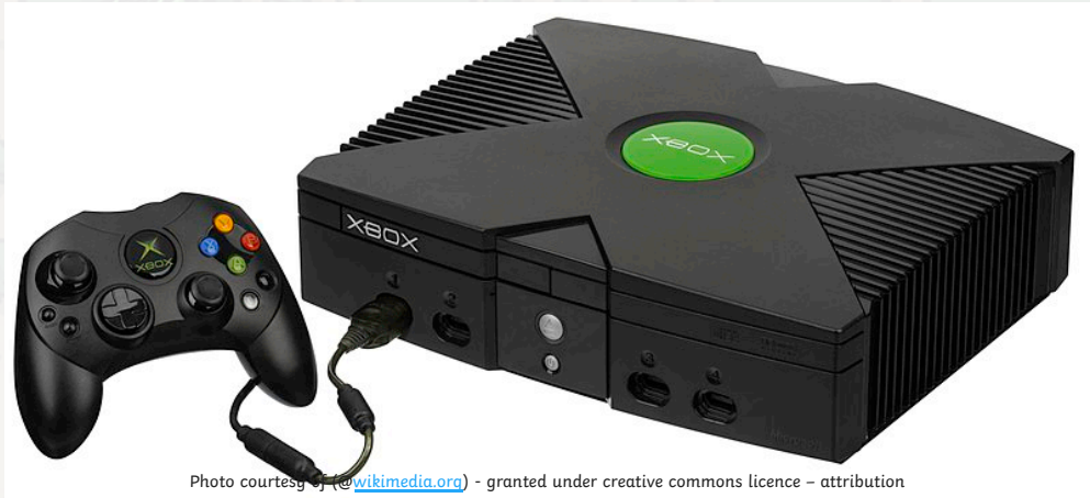
Photo courtesy of (@ wikimedia.org ) - granted under creative commons licence - attribution