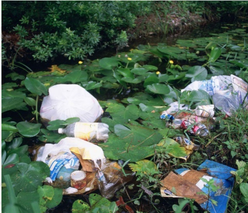
Photo courtesy of ( @Wikipedia.org ) - granted under creative commons licence – attribution