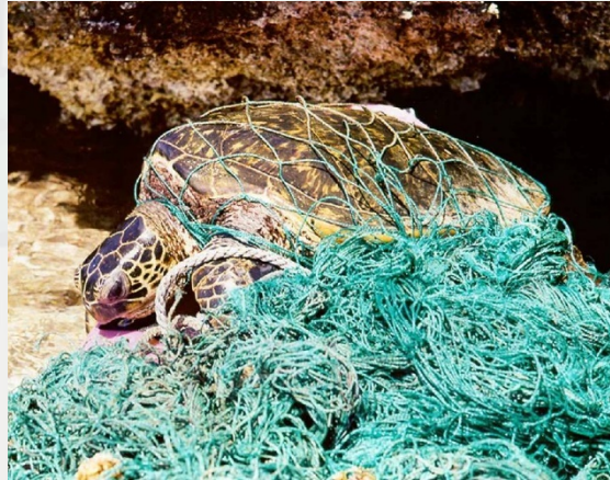
Photo courtesy of ( @noaaews.noaa.gov ) - granted under creative commons licence – attribution

Photo courtesy of ( @Wikipedia.org ) - granted under creative commons licence – attribution