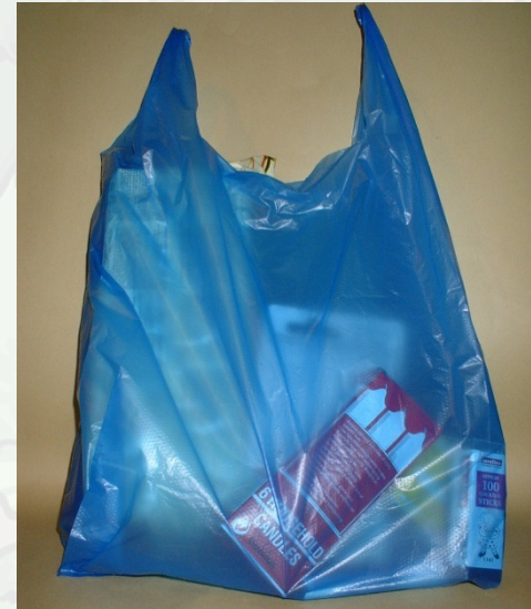
Photo courtesy of ( @flickr.com ) - granted under creative commons licence - attribution

Photo courtesy of ( @pixabay.com ) - granted under creative commons licence - attribution