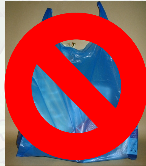
Photo courtesy of ( @flickr.com ) - granted under creative commons licence - attribution

Photo courtesy of ( @pixabay.com ) - granted under creative commons licence - attribution