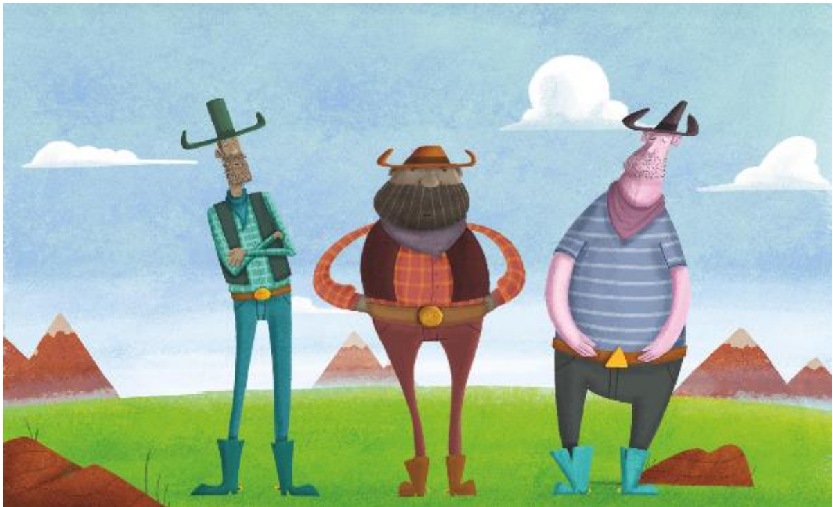
A group of cowboys

Cowboys were needed to move the cattle from one place to another. This could take months, so the cowboys lived and worked together and became friends.