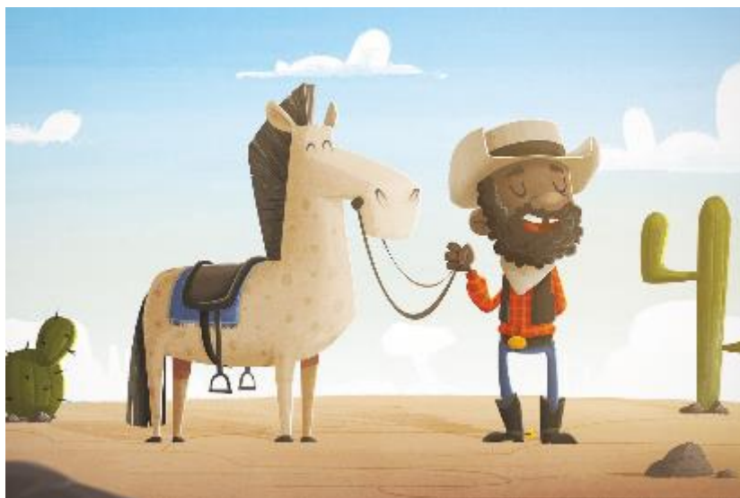
A cowboy with his horse

A long time ago, there were lots of cowboys in North America. Some were young and some were old; most were men and very few were women. They rode horses and looked after cows.