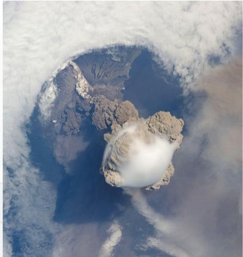
Clouds of hot ash, gas and rock as seen from space.

The gas, ash and rock are known as pyroclastic flows and travel great distances at speeds of up to 100 miles per hour.