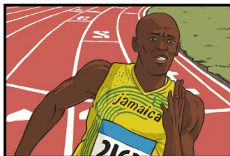
Usain Bolt: winner of three Olympic gold medals in London

Although other athletes have won more medals than Bolt, including American sprinter Carl Lewis who was commentating for a television network, no-one else can match the explosive power and unrivalled pace exhibited by Bolt.